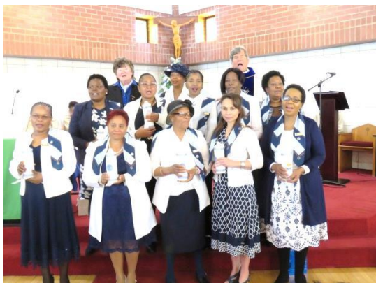
First inauguration of the C.W.L.