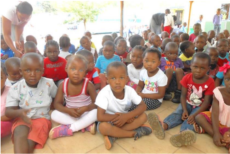
Children posing for their photograph and Graduations (picture below)