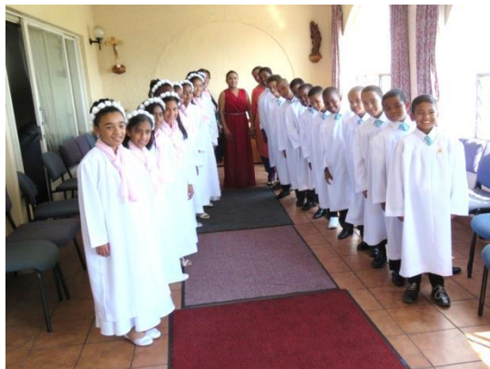
First communions