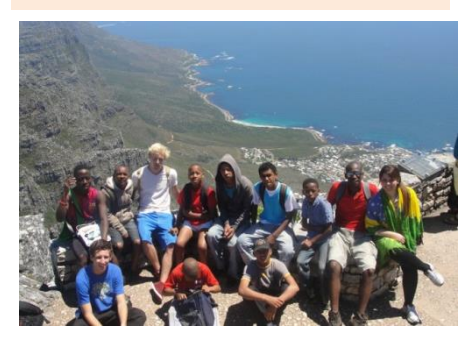
Children who come from Bo-Kaap to Bosco Skate Park enjoying the view from Table Mountain