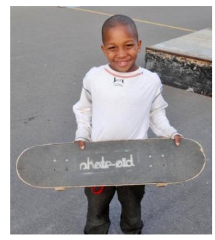
A member of the Bosco Skate Park

On 24 September the Salesian Youth Movement in Cape Town held a media education day at Our Lady Help of Christians in Lansdowne. About 30 young people attended this informative workshop which dealt with topics such as social media, the importance of looking critically at media and responsible use of social media. The young people were also given the opportunity to produce short