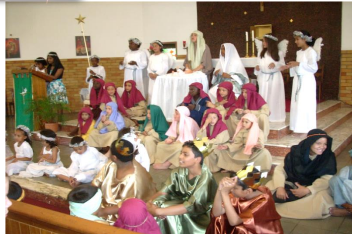
One of the annual Nativity Plays enacted by the Mary Help of Christians Primary School (run by the Salesian Sisters) and by the Catechists of Robertsham Parish, Gauteng