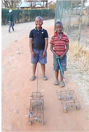
2 ENTHUSIAST ENTREPRENEURS FROM MAPUTSOE LESOTHO