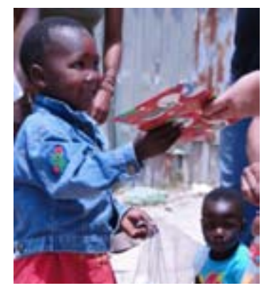
Let us remember that "more things are wrought by Prayer than this world dreams of."