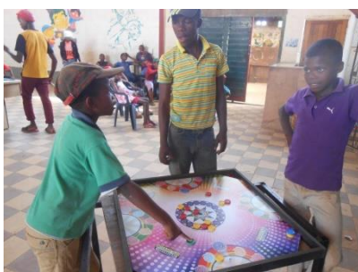
Maputsoe Oratory Lesotho

I WILL BLESS THE HOUSES IN WHICH THE IMAGE OF MY SACRED HEART IS EXPOSED AND HONOURED