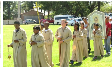
Scenes from the Salesian Youth Movement Don Bosco, Randvaal and Robertsham Parish.

Heroes are people who do what has to be done when it needs to be done, regardless of the consequences.