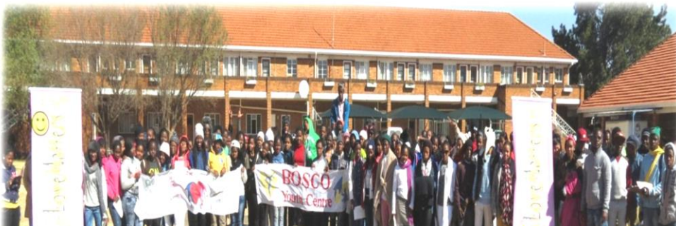
Celebrating LoveMatters, which has reached over 20,000 teenagers over 280 weeklong programmes at Bosco.