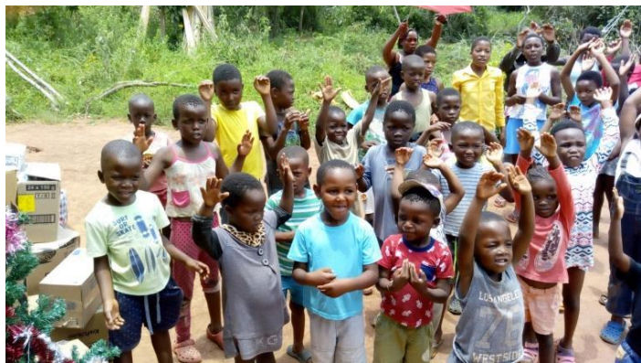
Children in happy mood in the 'FocusVillage' MALKERNS