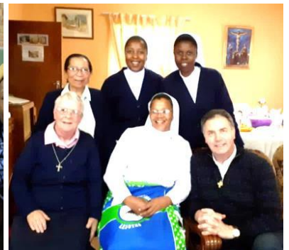
Welcome in Lesotho.