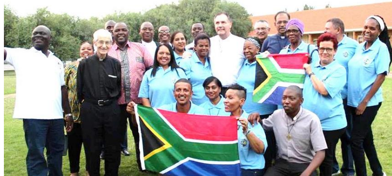
The Sisters in Boksburg and the Salesian Family in Bosco Randvaal