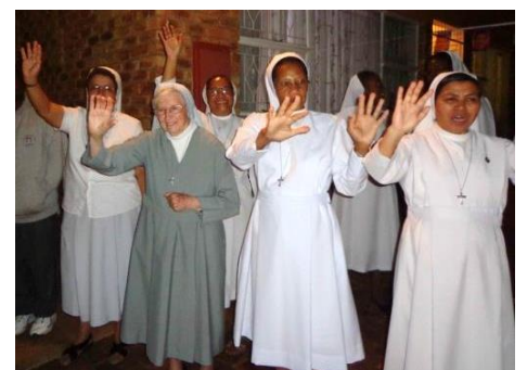
Farewell – Boksburg Sisters