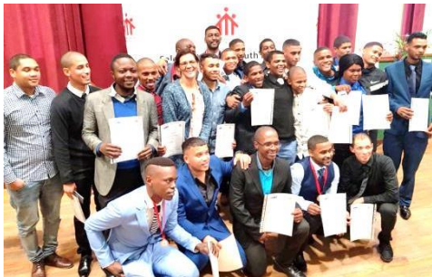
Salesian Institute - Cape Town