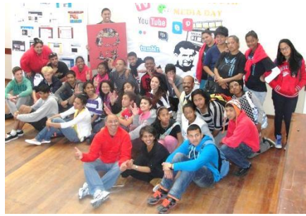
Bosco Centre - Gauteng