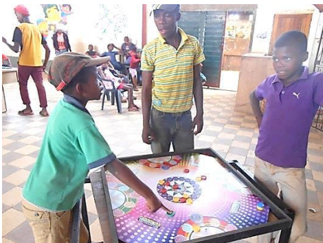
Maputsoe Oratory - Lesotho