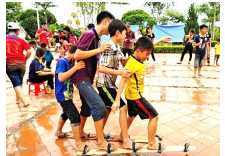
Hoa An Oratory - Vietnam