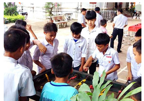
Hoa An Oratory - Vietnam