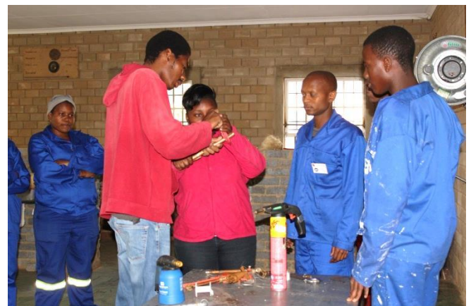
PLUMBING CLASSES - Students learning how to solder copper pipes