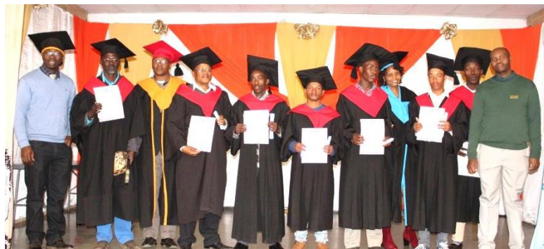
GRADUATION of the students in the Bricklaying Class