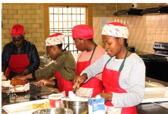
FAMILY AND CONSUMER SCIENCE CLASS learning how to bake cakes