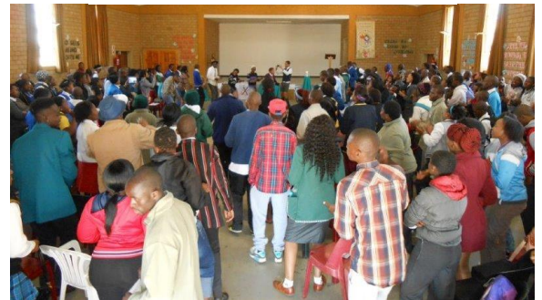
Celebrating Youth Day at Don Bosco Educational Hall, Ennerdale.