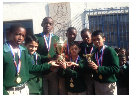
The School Cricket team won first place in the primary schools tournament for Swaziland.