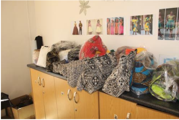
Various items made in the Arts & Crafts Workshop

ARTS AND CRAFTS (focusing on sewing and beading). Some items made in the workshop are either for sale or to be given to visitors or donors as a gift in recognition of the support provided. Others are for the display to show what can be produced from the Arts and Crafts workshop.