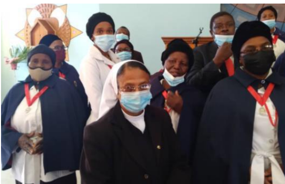
Sacred Heart Sodality celebrated their feast day on 3 rd July 2022 and the members of St. Anne Sodality Celebrated their feast day on 31 st July 2022.