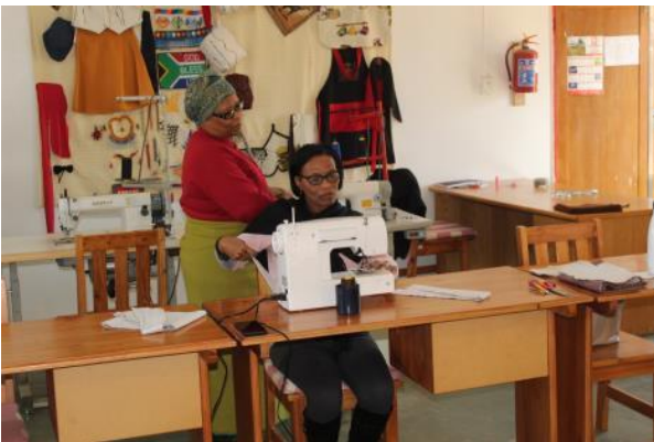
Table mats made in the Arts and Crafts Workshop