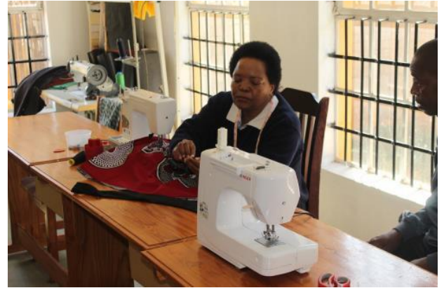
The Facilitator demonstrating to a learner