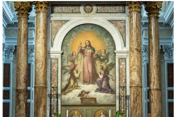
BASILICA OF THE SACRED HEART OF JESUS IN ROME. Built by Don Bosco in 1887.

“Jesus meek and humble of heart make my heart like yours”