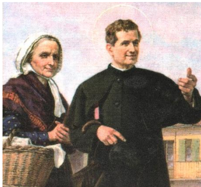
Don Bosco with his mother Mama Magherita