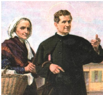
Don Bosco with his mother Mama Magherita