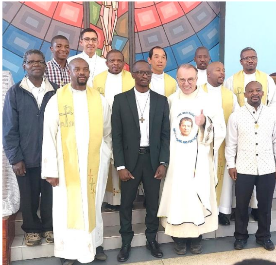
MALKERNS ESWATINI JULY 2024