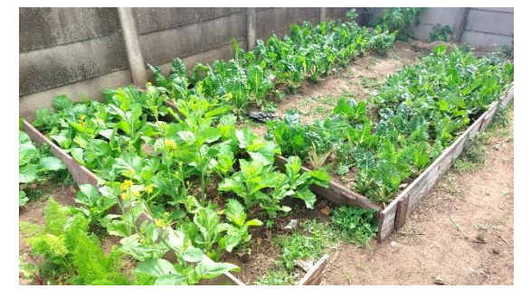
Even in Booysens the small 'Laudato si' garden is growing