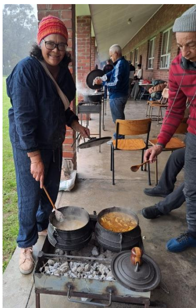
Continuing their Centenary celebrations the parishioners had a Potjiekos Competition