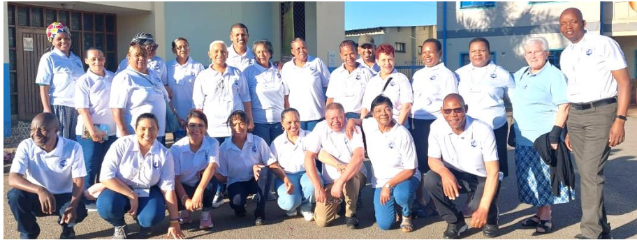
SALESIAN CO-OPERATORS OF SOUTHERN AFRICA