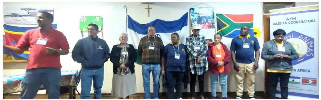
PROVINCIAL COUNCIL OF SALESIAN COOPERATORS

A Salesian Co-Operators workshop was held in Eswatini at the beginning of October. Present were the Provincial Council and the Salesian Co-Operators of Southern Africa, as well as 50 representatives from the Provinces of South Africa, Lesotho and Eswatini.